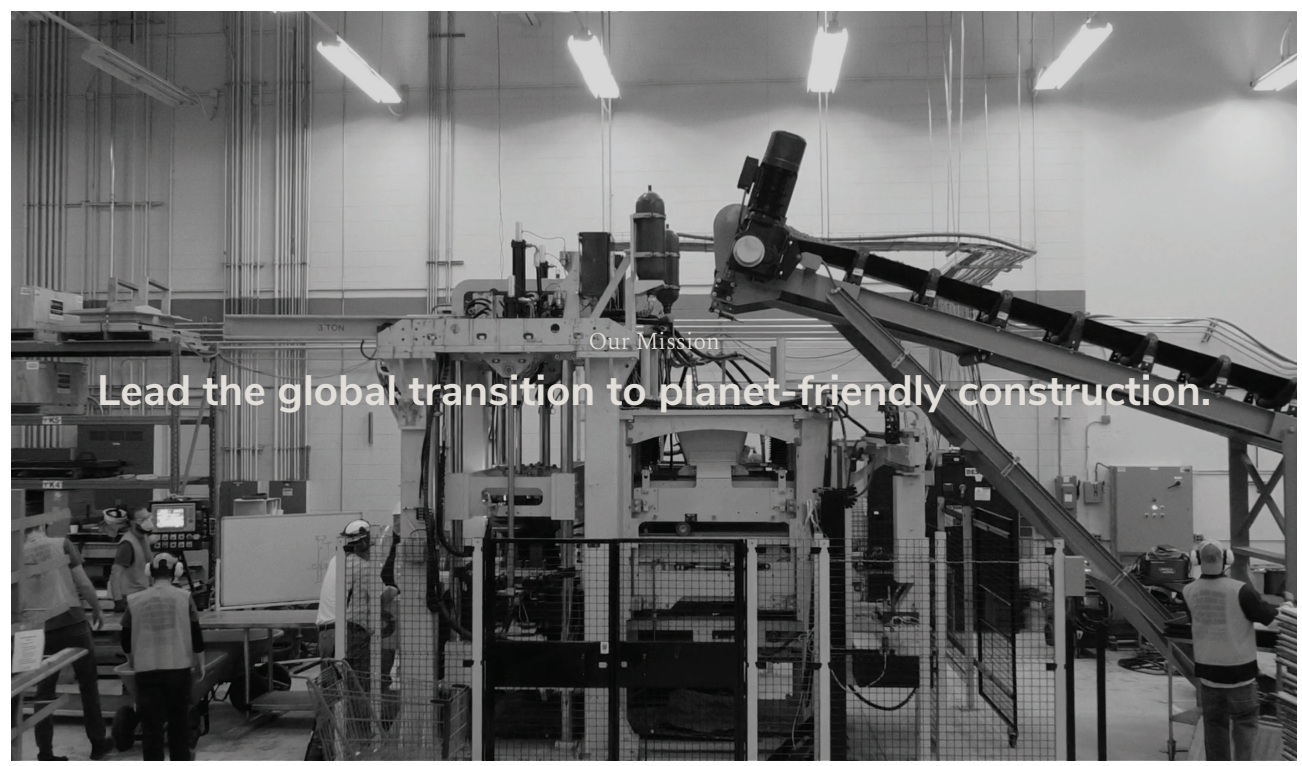
Biomason, new mission statement from new brand website

Biomason's current product offering includes bioLITH® tiles, designed for exterior and interior use in commercial, institutional and residential building projects. To learn more about how Biomason builds with biology enabling radical reductions in carbon emissions visit their new website: <a href="https://www.biomason.com">www.biomason.com</a>.